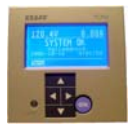
Monitoring unit type PCM2

Monitoring of the complete DC system. Clear graphical display for showing and setting of alarms, operating data, etc. Remote alarm via 4 freely configurable relays.